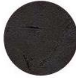
M04 Nefo Black