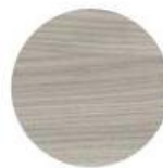
M12 Grigio chiaro Light grey