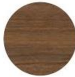
M25 Noce fiammato Flamed walnut