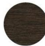
M26 Rovere Moro Dark oak