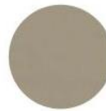
M07 Corda Sand