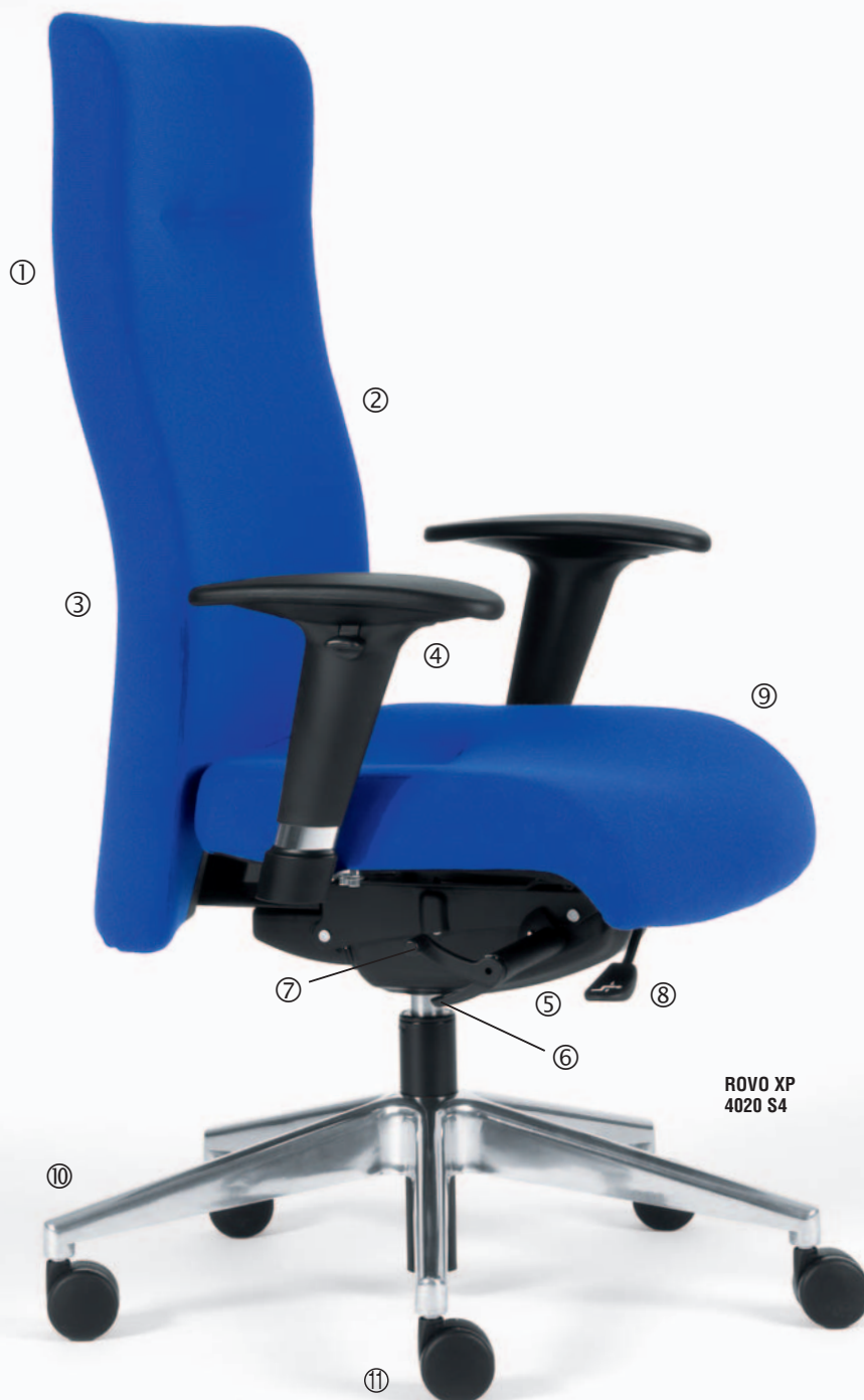
ROVO XP 4020 S4

- for soft flooring (standard) - for hard flooring (optional)