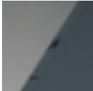
Glossy Fumè Glass