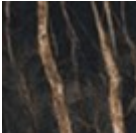
Crystalceramic with effect noir desir marble